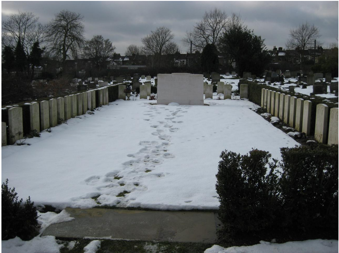
Beckenham Crematorium & Cemetery