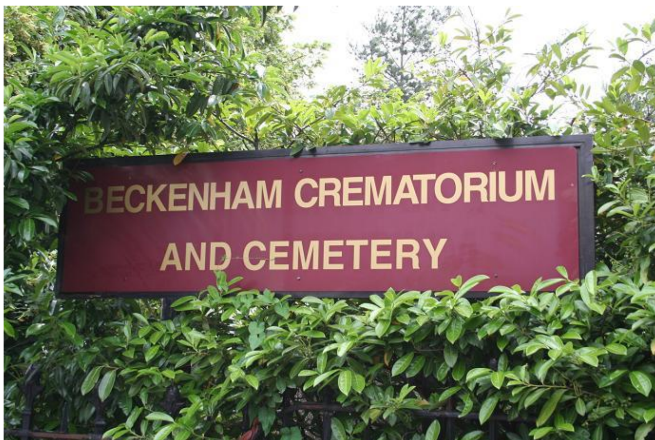
Beckenham Crematorium & Cemetery