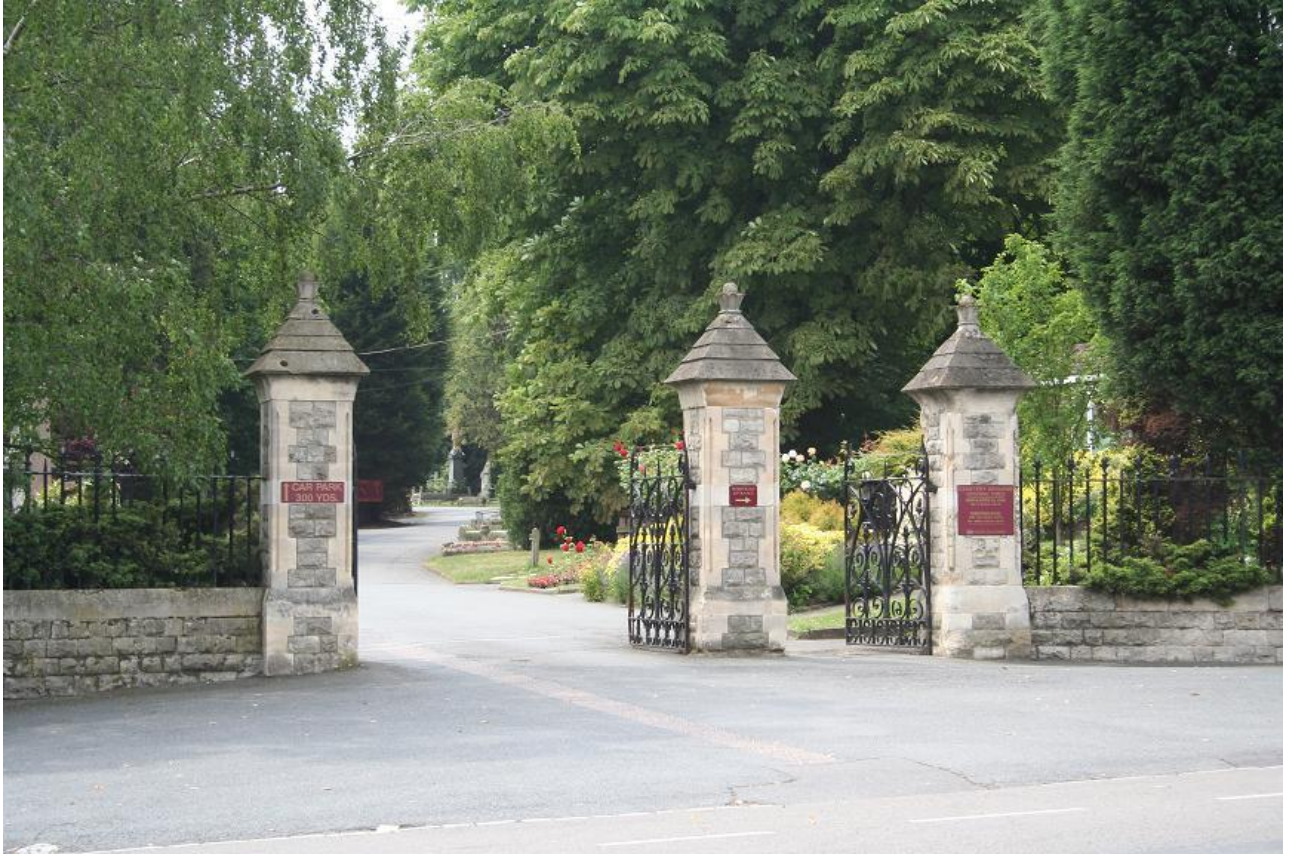
Beckenham Crematorium & Cemetery